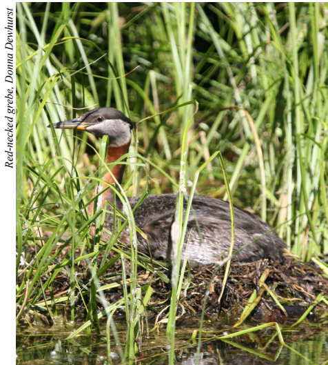
Red-necked grebe, Donna Devilturst

NABCI Action 4.2: Improve coordination and efficiency of data management efforts by providing centralized data repositories that are readily accessible by the monitoring community, analyze “gaps” in current data management systems to identify additional data repositories that need to be developed, and identify resources necessary to develop and maintain these coordinated data management efforts.