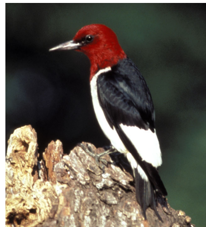
Red-headed woodpecker. Dave Menke

We define “coordination” as the ability to align the various elements of monitoring programs (i.e. design, implementation, analysis, reporting, and evaluation) among stakeholders across appropriate spatial and temporal scales. Effective coordination among stakeholders requires identifying mutual information needs, developing collaborative approaches, leveraging fiscal resources, building information networks to report and share results, and identifying leadership. Although politically and logistically challenging, we argue that almost all local monitoring projects could provide more general and useful information if efforts were coordinated beyond the local scale.