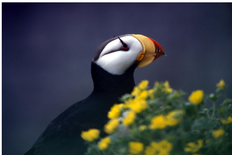
Horned Puffin